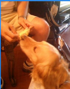
Cami R. demonstrates the proper way to eat corn on the cob. It's much easier when somebody holds it for you.

Bring your dogs and enjoy the day at Greentree!