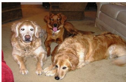
From left to right, Jasper, Ginger, and Amos all pose for the camera. Ginger stayed with her old Foster Family while her new Forever Family was out of town!